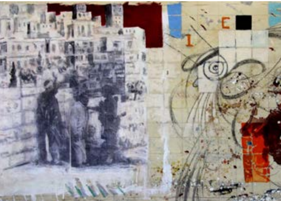
Artwork by Asad 'Azzi'.

Israel, as a state-building model, is a failed experiment – ideologically, religiously, politically, socially, and, if US-favored-nation status were removed, possibly economically as well. Without immediate and decisive intervention from the international community to stop the ongoing Israeli aggression towards Palestinians, Israel's intransigence and US-equipped regional hegemony will not only fuel another generation of Palestinians willing to sacrifice their lives to achieve their freedom and independence but will also further jeopardize Israel's future as a state.