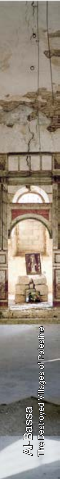
Al-Bassa The Destroyed Villages of Palestine